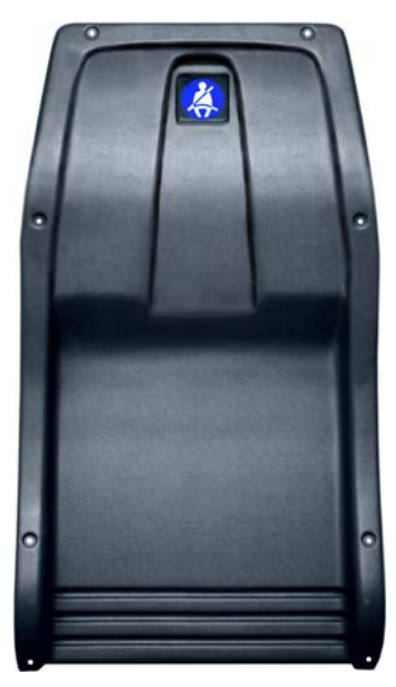
Fig.1 - Recessed ABS Back