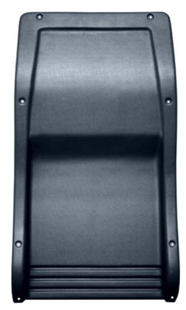
Fig.2 - Standard ABS Back